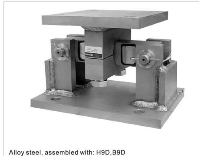
Alloy steel, assembled with: H9D,B9D